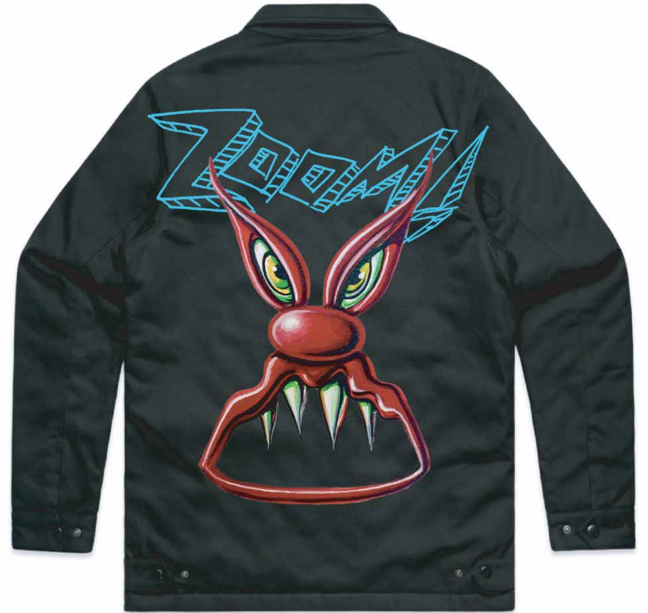
SERVICE JACKET 5523