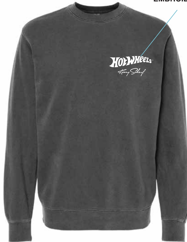
IND3500 SWEATSHIRT GARMENT DYE