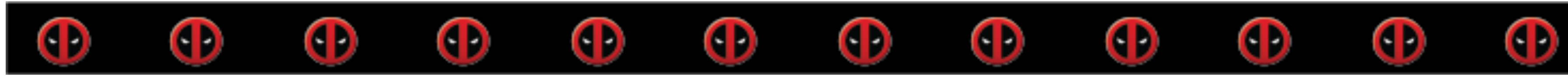
CUSTOM BACK NECK TAPE