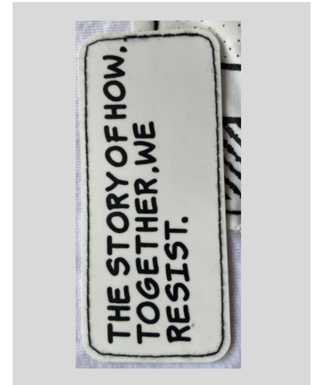
RUBBER HEAT TRANSFER