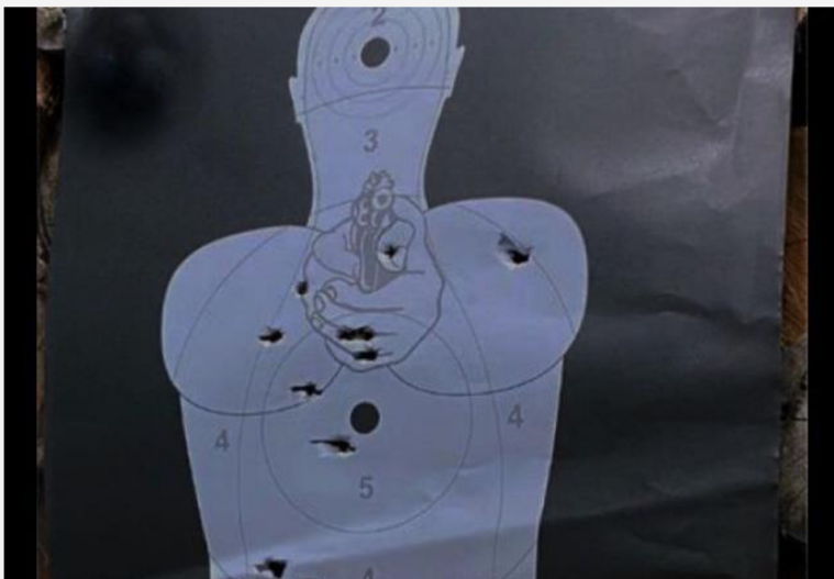
Army authorized the opening of 871 shooting houses in three years of Bolsonaro government

Ouvir: Número de clubes de tiros dobrou em três anos de governo Bolsonaro - 0:00 ouvir