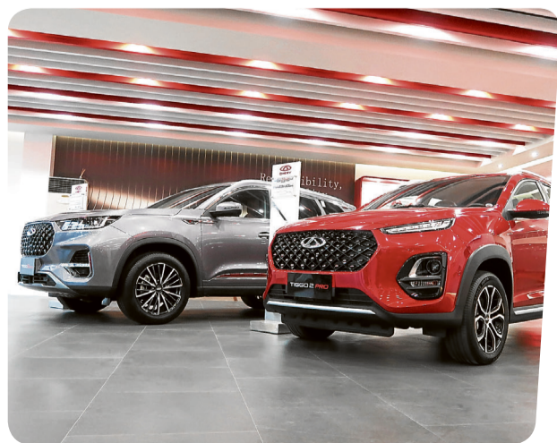
The Tiggo 2 Pro and the Tiggo 8 Pro at the display area.

Visit CHERY Auto PH on its improved website at www.cheryauto.ph and follow CHERY Auto PH on social media: CHERY Auto Philippines (Facebook) and @cheryautophilippines (Instagram) for more updates. You may also call the 24/7 CHERY Auto Philippines hotline at (0917) 552 4379 or email chery@uaagi.com for more info.