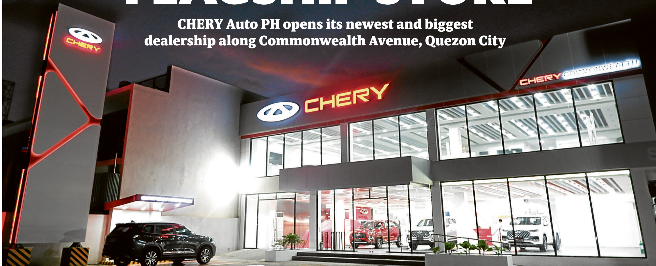
The well-lighted facade of Chery Commonwealth is now a prominent sight for motorists passing through one of the busiest roads in the country.

CHERY Auto PH opens its newest and biggest dealership along Commonwealth Avenue, Quezon City