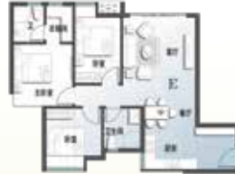
2 Bedroom Unit XX.XX SQM