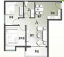
3 Bedroom Unit XX.XX SQM