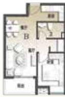
1 Bedroom Unit with Living Room XX.XX SQM