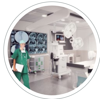
Larger, modernized operating rooms increase efficiency.