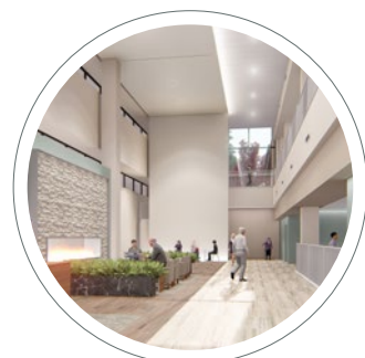
Well-designed spaces provide easier access to services.