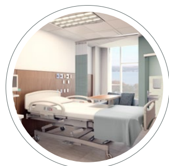
Private patient rooms provide a quiet place to heal.