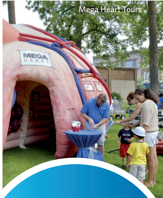
Mega Heart Tours