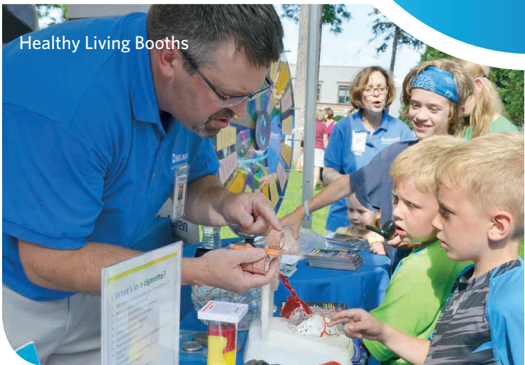
Healthy Living Booths