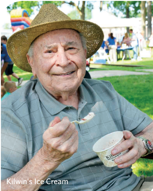
Kilwin's Ice Cream