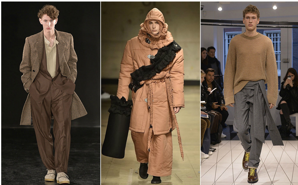
From left to right: E.Tautz, Craig Green & Chalayan | Image Credit: catwalking.com

An autumn/ winter favourite, camel is back this year. Forget camel outerwear (though we do love a camel coat), AW17 is all about camel from head to toe. Mix shades and patterns for maximum impact or play it safe and break the outfit with a well placed pop of navy or cream.