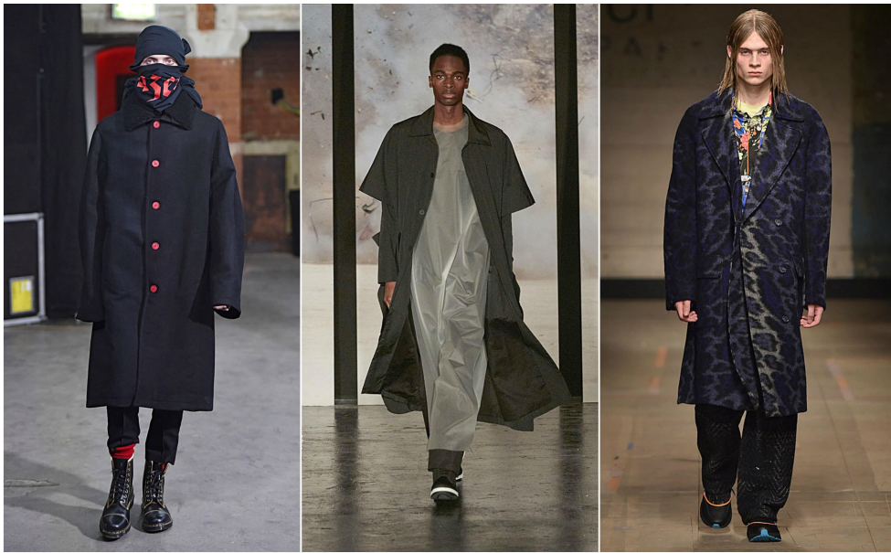
From left to right: Agi& Sam, Berthold & Topman Design

Give your outerwear some personality with a super-long coat - coats that dip between ankle and almost floor-length are totally happening next winter, from tailored, belted trenches to floor-length puffers. Take notes from Topman and brave it with coats which went big in both print and form.