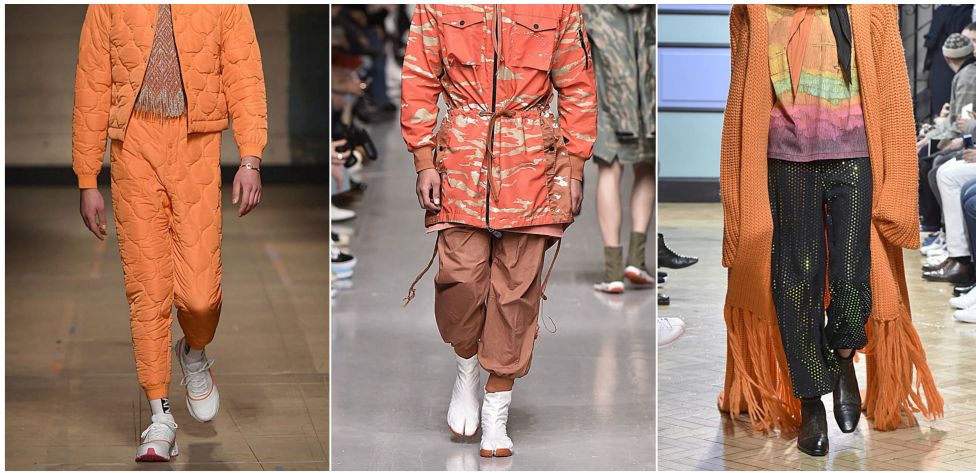
From left to right: Topman Design, Maharishi & J.W Anderson

Bright orange burst through the men's AW17 catwalks. Add a zing of interest to your black, navy and grey staples this season with this bright hue.