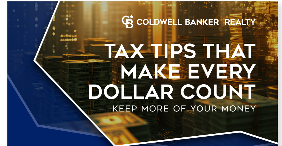
Email Concept B Straight-Forward | Finance-based