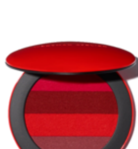
Westman Atelier Lip Suede

A list of luxury products would be incomplete without at least one chic candle pick. If there's one fragrance and candle brand that sparks up interest, it's Brooklyn based perfumery D.S. & Durga. The packaging, illustration, and music references alone are highly appealing. I'll take the Portable Fireplace Candle if that's ok please? Smoky, woody and comforting — I'm here for it!