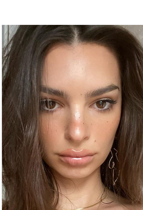
AESTHETICS Could A Botox Lip Flip Be The Alternative To Filler You've Been Looking For?