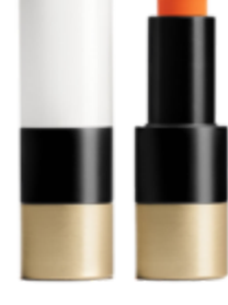
Rouge Hermès Matte Lipstick

Fact: Herbivore Products are gorgeous to look at. (I mean, look at this one, it's practically a unicorn in a jar) Another fact: they are crafted with all natural, organic, food grade ingredients. The Prism Exfoliating Glow Facial is powered by smoothing and softening AHAs and BHAs, along with a hydrating boost of aloe vera and rose water. It's the perfect end of 2020 treat for your skin (it's been through enough this year).