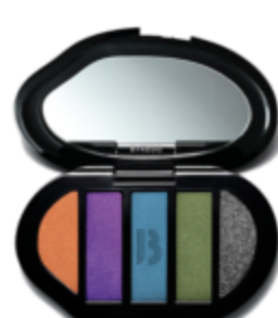
Byredo Eyeshadow Palette

As a self-confessed makeup lover, I am constantly enamoured by new, shiny, pretty objects to put on my face. Maybe it's the anticipation and curiosity of finding a new potential holy grail lipstick (muted red please...I'm extremely specific)? Perhaps it's the excitement that comes with the satisfying click of a brand new compact. Maybe it's simply scrolling and browsing new releases (it's a proven method of stress relief, I swear!) Whatever it is, the result is an ever expanding wish list of highly desirable products. Even if they are out of my financial comfort zone, it's okay! Making an imaginary wish list of products can be fun as well. Scroll below for the 5 luxury products that have stayed on our wish lists in 2020!