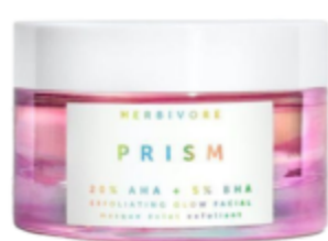
Herbivore Prism Exfoliating Glow Facial

From the editorial shoots to the slick packaging, everything about Byredo's new makeup range just screams out "cool as f*ck". The colour sticks are already a fast favourite of mine — super blendable multi-purpose creamy pigment in an array of not-so-typical shades are the way to my heart! However, it's their latest release which truly stands out. These gold sculptured eyeshadow palettes are a work of art alone, but the five rich, creamy electric shades are something very special.