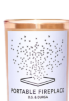
D.S. & Durga Portable Fireplace Candle

It's important to note that this lipstick is $67. Yes, it's a hard pill to swallow. However, at the risk of sounding dramatic, everything (bar the price) about this product is perfection, including the minimalist, colour-block refillable packaging, and the selection of satin and matte shades. 33 Orange Boite definitely has my name on it.