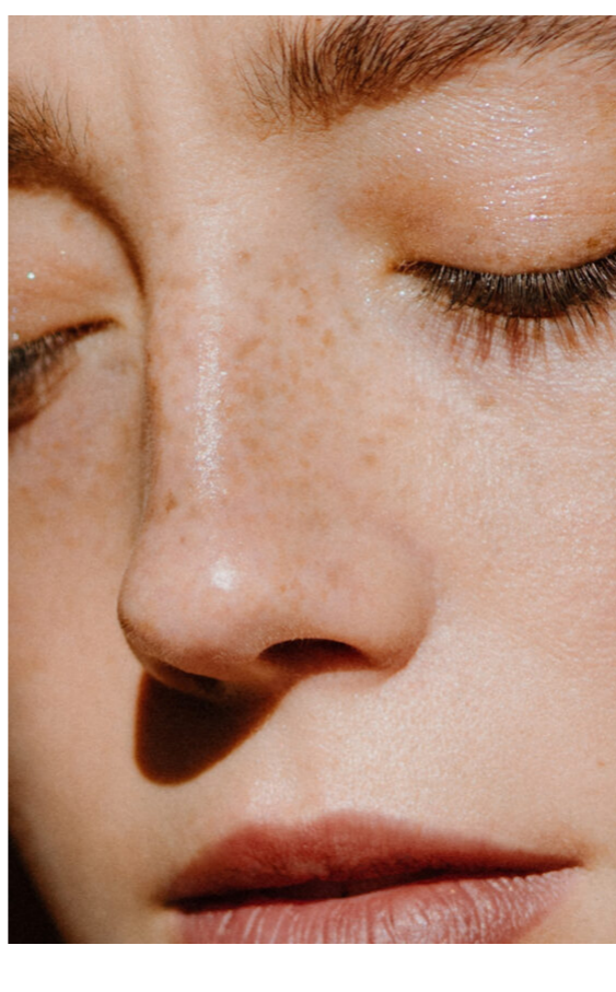
FACE The Dark Side Of Lash Serums