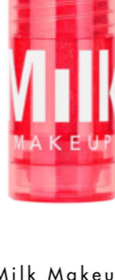
Milk Makeup Glow Oil

Keep reading for five multitaskers that do double (or triple) the work.