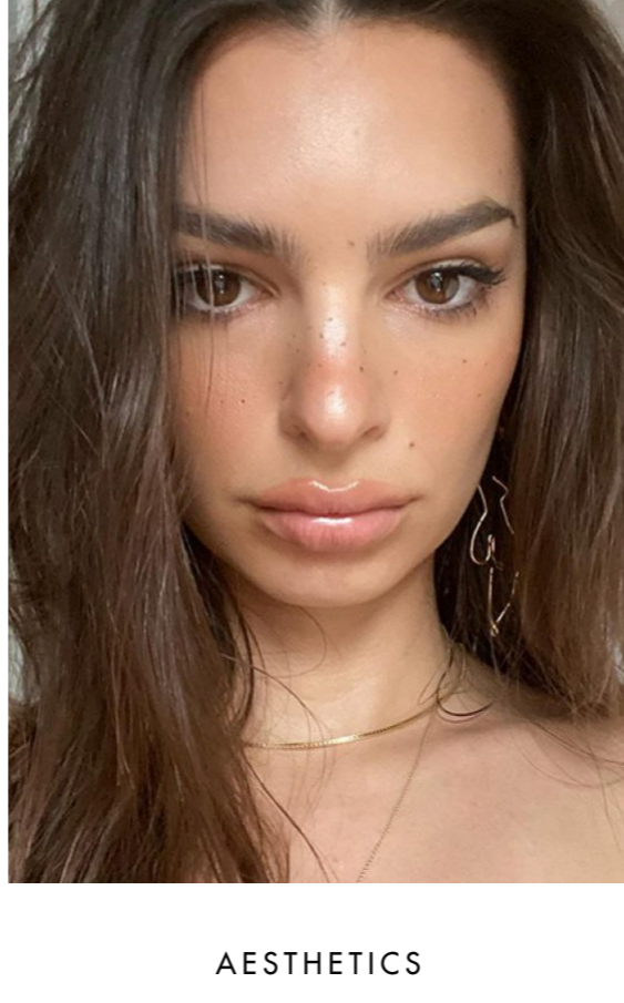
AESTHETICS Could A Botox Lip Flip Be The Alternative To Filler You've Been Looking For?