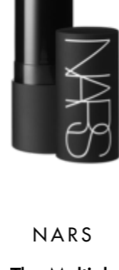
NARS The Multiple

Milk Makeup's Glow Oil serves up some major "just emerged from a sun-drenched pool" looks. Apply on cheeks for a healthy sheen, or, swipe on lips and and eyelids for a subtle glow. The solid oil formula manages to be vibrant but also sheer and dewy as hell. Don't be put off by the mini size — this outlasts both humidity and torrential rain (living proof here).