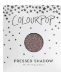
Colourpop Pressed Shadow

I have not come across a single person who does not sing the praises of Glossier's Cloud Paint. It's just that damn good. When tapped into the high points of your cheeks, it works beautifully as a blush. I've also been into dabbing the shade Dusk on my lids for a neutral eye, and the shade Haze gives me dreamy crushed raspberry looking lips. It's a multitude of products in one little tube.