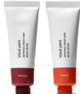
Glossier Cloud Paint

One foundation to rule them all? Kevyn Aucoin's Sensual Skin Enhancer really is just that. The concentrated formula is basically witchcraft in a jar. Whilst this works like a dream as a no-nonsense, heavy-duty concealer on blemishes and dark circles, you can also mix with a few drops of your preferred nourishing face oil to transform into a super sheer skin tint.