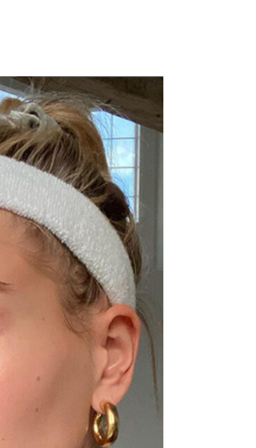
AESTHETICS Could A Botox Lip Flip Be The Alternative To Filler You've Been Looking For?