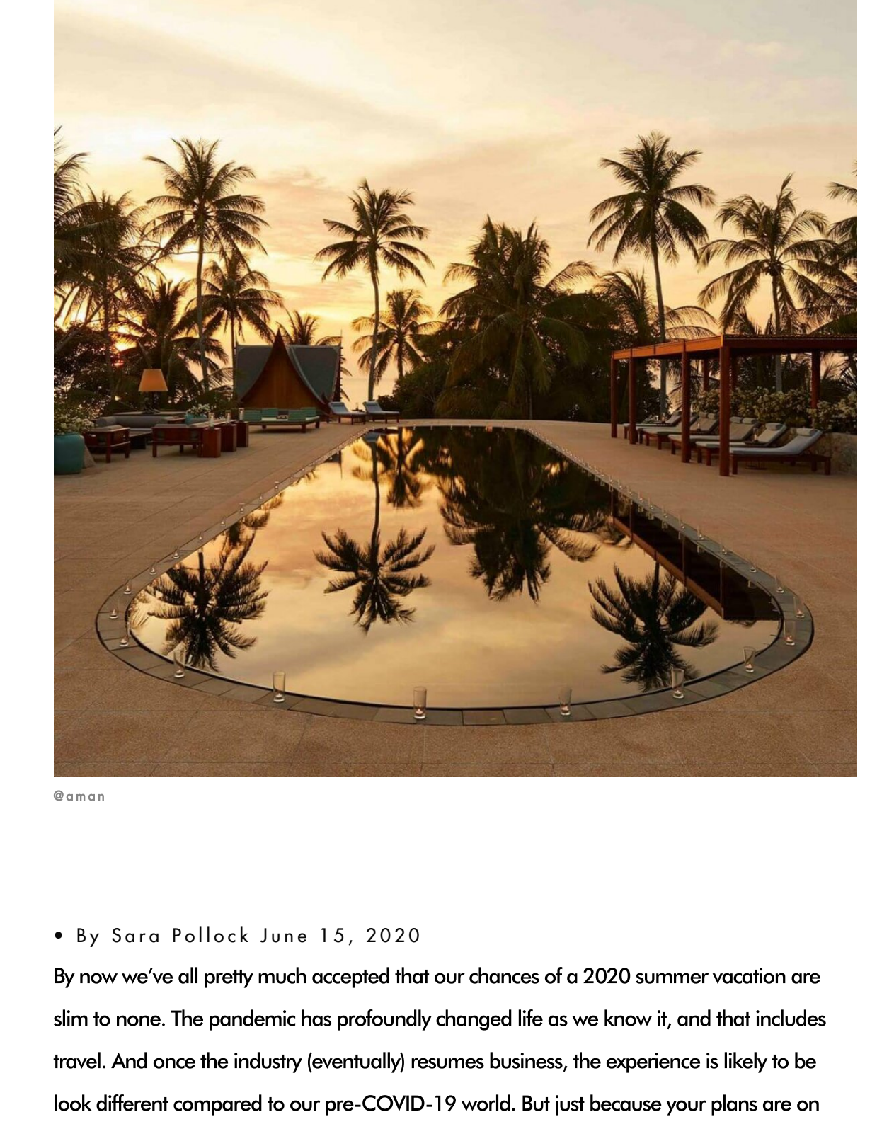
hold until 2021 and we're stuck at home for the foreseeable future doesn't mean you can't use a little imagination and envision laying on a Caribbean beach whilst being in your own backyard/shower/bedroom. Let these products that smell like vacation mentally transport you, sans airfare!