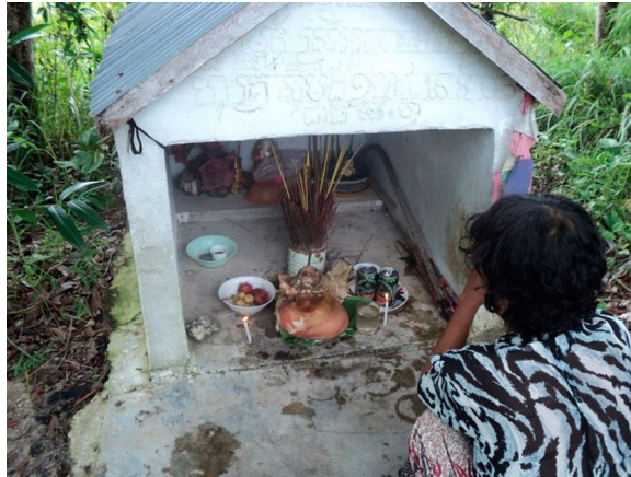
Figure 6. Ctum of Lok Ta Bung Komnap.

visited Reut in a dream and said they were lonely, that they missed the music and the parties they used to have . After his dream, Reut built the couple a house as they requested, put out plates for offerings, and represented Ta Gum Yay Tia with two stones at the back of their ctum (Figure 8). Communication continues and they requested and received stairs and a window for their abode. After installation of the window in 2006, a termite mound began to grow next to the tree (Figure 9), a potent sign of earth energies, and Reut sees this as a testament to both his caretaking and the power of this neak ta .