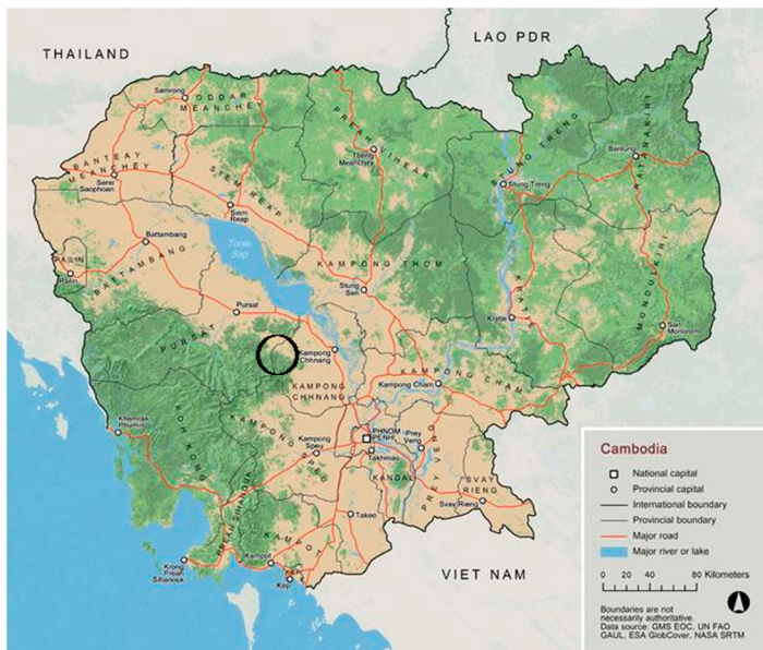
Figure 1. Cambodia Map: Black Circle marks the region where this study took place.

This piece contributes to emerging studies on the role of animist practice, through the lens of chthonic entities and their potent entanglement with political economy and socio-environmental relationships (Blaser 2013; de la Cadena 2015; Sprenger 2016; Szerszynski 2017). My data adds real-time ethnographic encounters that clarify and