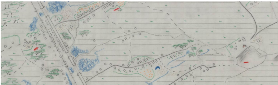
Figure 4. Close up of three locations for lok ta . Red dot in east is Lok Ta Oh, central is Lok Ta Bung Komnap, and west is Lok Ta Gum and Lok Yeah Tia.

If Lok Ta Oh has a story, it is now forgotten, but the mountain that is Grandfather Stream has more power than any of the other neak ta in the region. After resettlement began, Lok Ta Oh intervened into a woman's private prayers for a child. Following a dream, her husband built a ctum and made an offering at the base of the mountain. The child was born and offerings continue at this spot. About the characteristics of