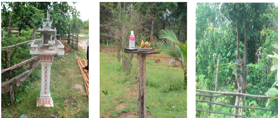
Figure 3. Front yard ctum for the maja tuk maja day (fancy, plank on post, and nook of tree).

These propitiations to the owner of the water and the land are specific to the work of carving a human space out of the forest. They come from an original position of respect, fear and care. The relationship between resource use and caretaking that founds deals with the chthonic sovereign is obscured when neak ta are entangled with village founders, Buddhist religion or understood to be protective ancestor spirits that articulate the space between forest and village (Aymonier 1900; Mus 1933; Ang 1986; Paṅḍity 1989; Forest 1992). What I draw out here is how Ming Tri's invocation pushes the Khmer neak ta closer to the conceptions of the highland shifting agriculturalists, who do not 'eat to excess' or 'kill for no reason' (Condominas 1977, 107), and also resonates with Valerio Valeri's description of Huaulu hunters, who 'must always strike a deal, pay a price for using the land' (2000, 308).