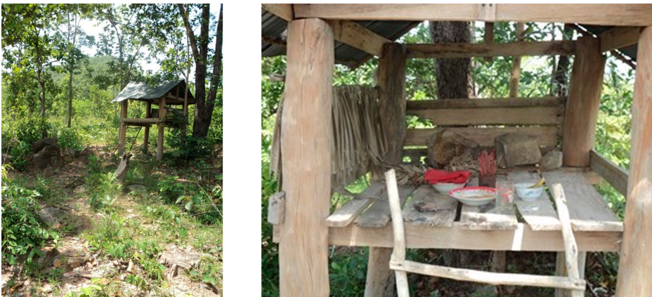
Figure 5. Ctum of Lok Ta Oh at the base of the mountain.

Wealth rose from the land here with Cambodia's opening to the global market. Timber was freely available for harvest and the land was free for those strong enough to clear and settle it. 7 This work in which the powerful take from the less powerful and cause everything to disappear, was often in violation of neak ta relations (see Sprenger and Großmann 2018; and Work 2018, for discussions of this dynamic). Some carved out very nice land claims for their families, but many villagers flounder at the edge of subsistence, and the resources are dwindling. In an earlier era of colonial extraction, settler habitation also spread along the railroad tracks in this region (Work 2014), and this is where Ta Gum Yay Tia emerged shortly after Ta Reut and other timber labourers cleared land, and expanded their holdings into this area. They