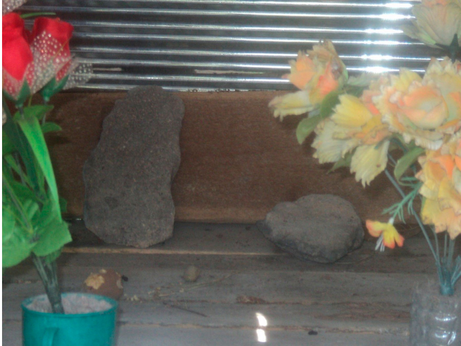
Figure 8. Stone representations of Ta Gum and Yay Tia.

human ancestors, this is a state effect. The forest gives rise to the village (Forest 1992, 15), and everything of value comes from it. In Sambok Dung, most families went regularly into the forest to collect food and useful products, as well as timber. Only the wealthy who bought their food from the market were able to draw a line at the edge of the village and feared the wild space beyond.