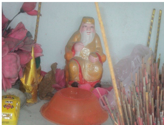
Figure 7. Lok Ta Bung Komnap as a Chinese land diety.

The neak ta I encountered in Sambok Dung complicate the division between the forest and the village, the srok and the prei so commonly found in the literature on Cambodia. I suspect that like religion, and the idea that chthonic energies are