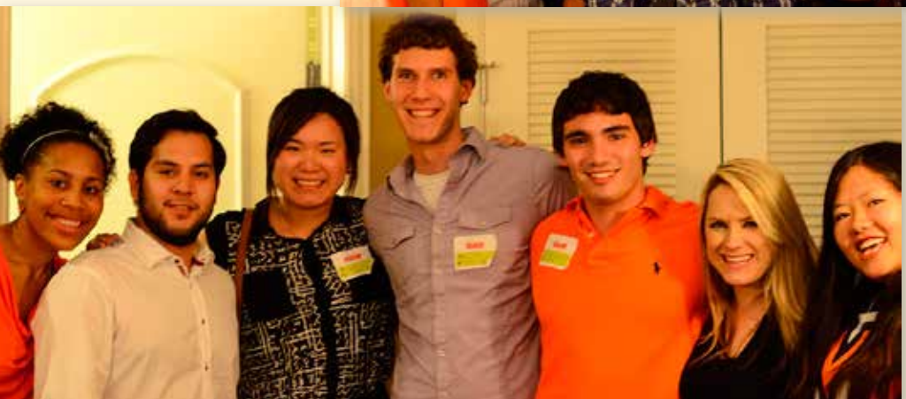
Sage & friends leave the rat race behind and rock out with Rat Ranch.