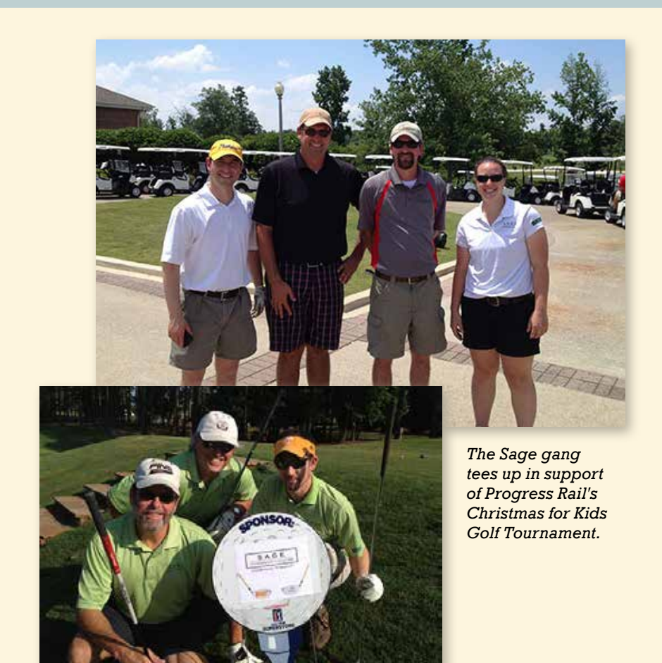
Sage's sponsored hole.