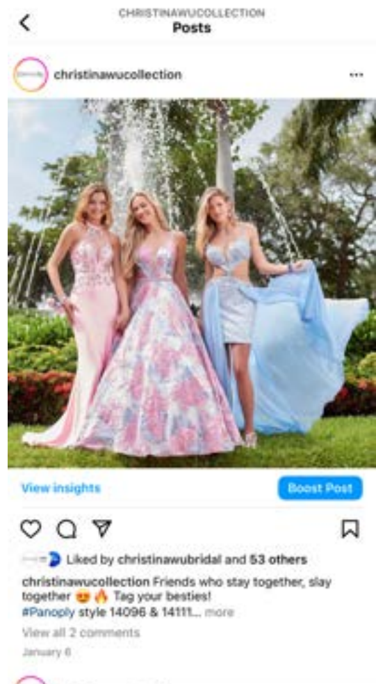
christinawucollection View insights Boost Post Liked by christinawubridal and 53 others christinawucollection Friends who stay together, stay together 🥰👗 Tag your besties! #Panoply style 14096 & 14111... more