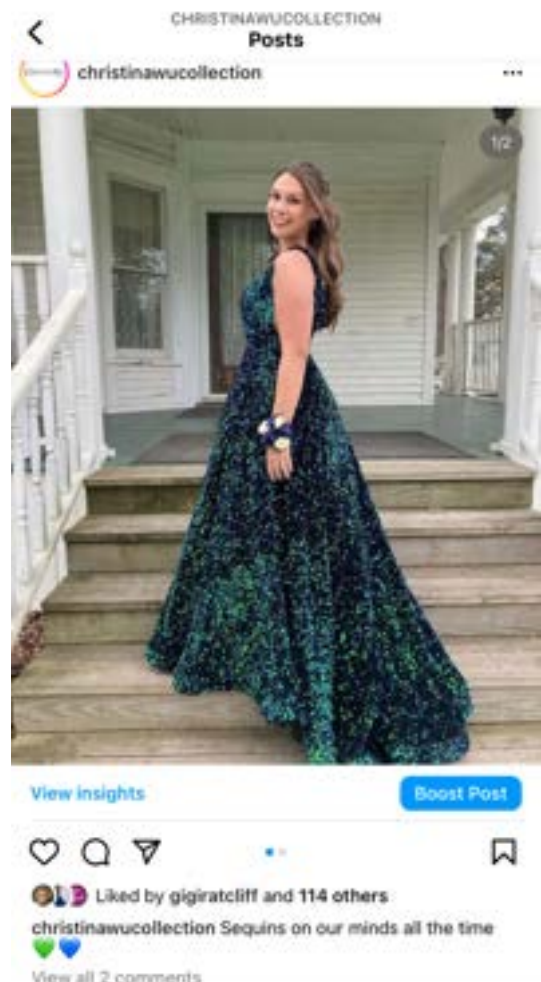
christinawucollection View insights Boost Post Liked by gigiratcliff and 114 others christinawucollection Sequins on our minds all the time