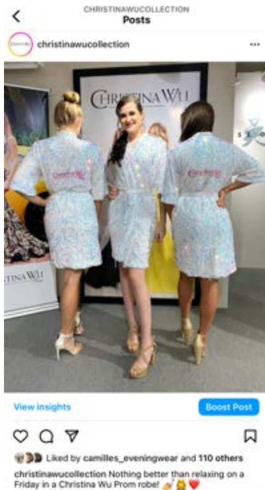
christinawucollection View insights Boost Post Liked by camilles_eveningwear and 110 others christinawucollection Nothing better than relaxing on a Friday in a Christina Wu Prom robe! 🥰👗❤️