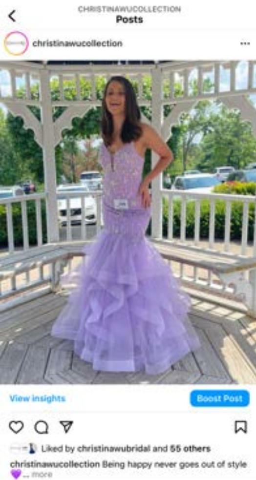
christinawucollection View insights Boost Post Liked by christinawubridal and 56 others christinawucollection Being happy never goes out of style