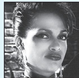
Dawson in 2005's Sin City .

Whether she's articulating how each cinematic Batman through the decades has reflected the comics as well as the political climate of the time,