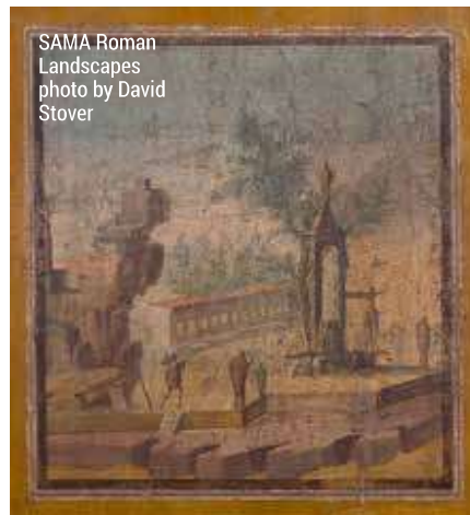
SAMA Roman Landscapes