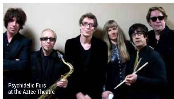
Psychidelic Furs at the Aztec Theatre