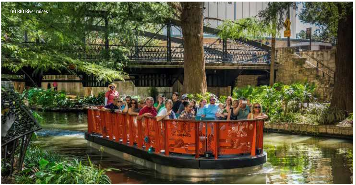
GO RIO River cruises