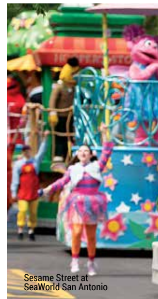
Sesame Street at SeaWorld San Antonio