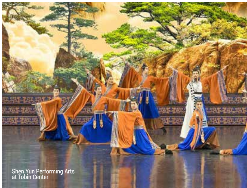
Shen Yun Performing Arts at Tobin Center