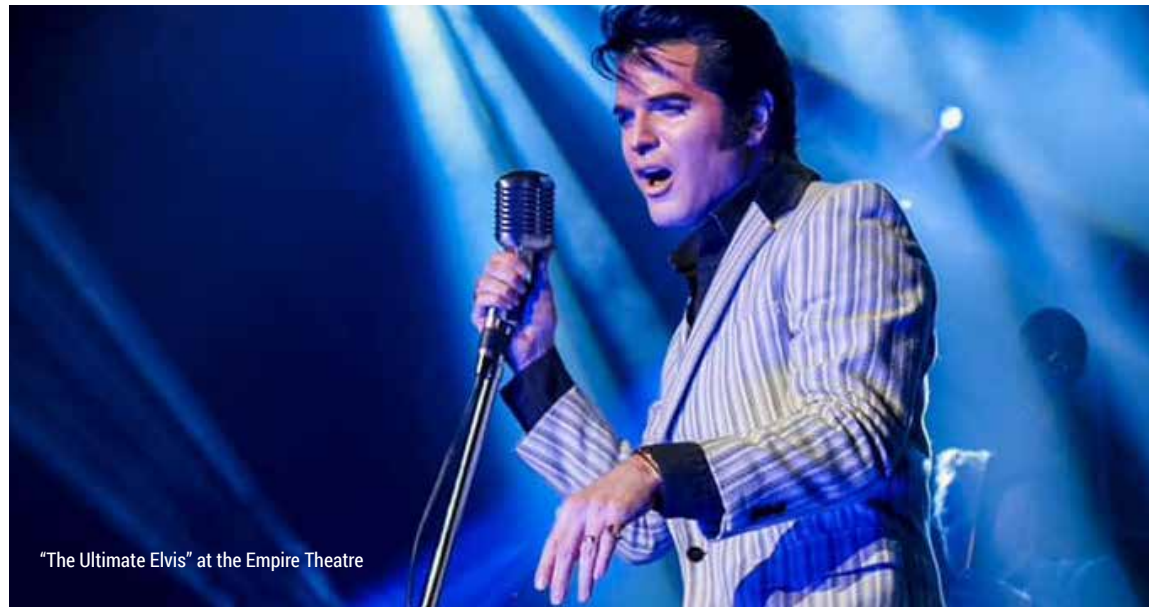
"The Ultimate Elvis" at the Empire Theatre