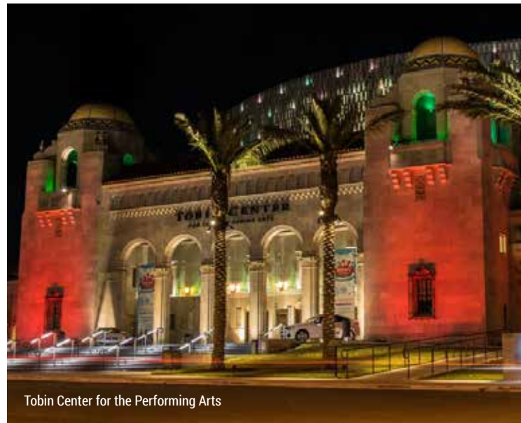
Tobin Center for the Performing Arts