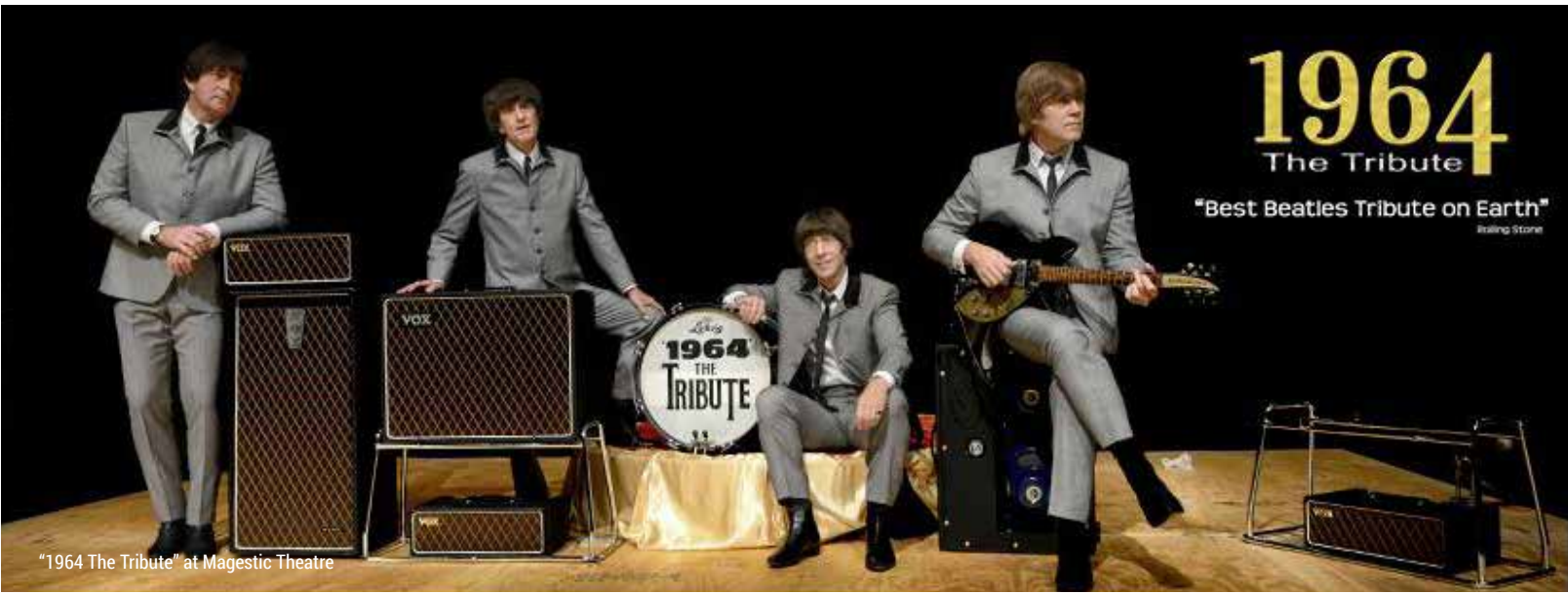
"1964 The Tribute" at Magestic Theatre