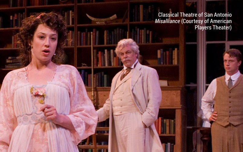
Classical Theatre of San Antonio Misalliance