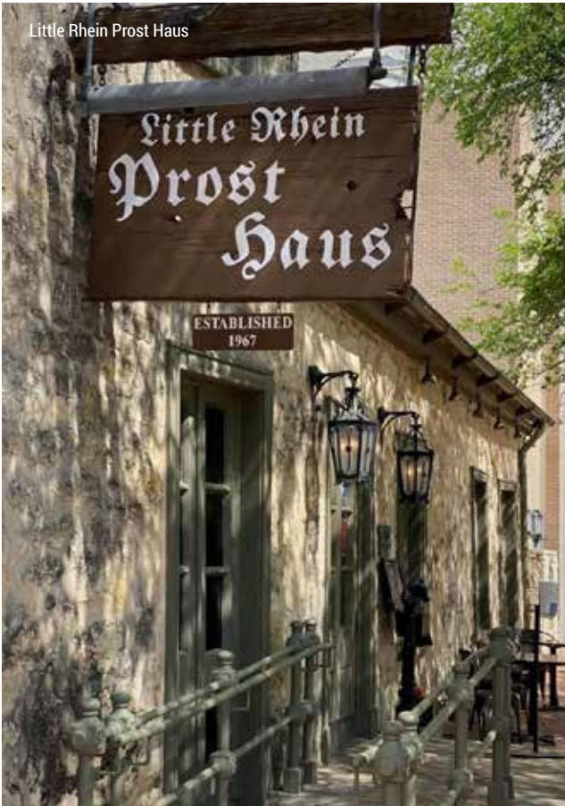
Little Rhein Prost Haus