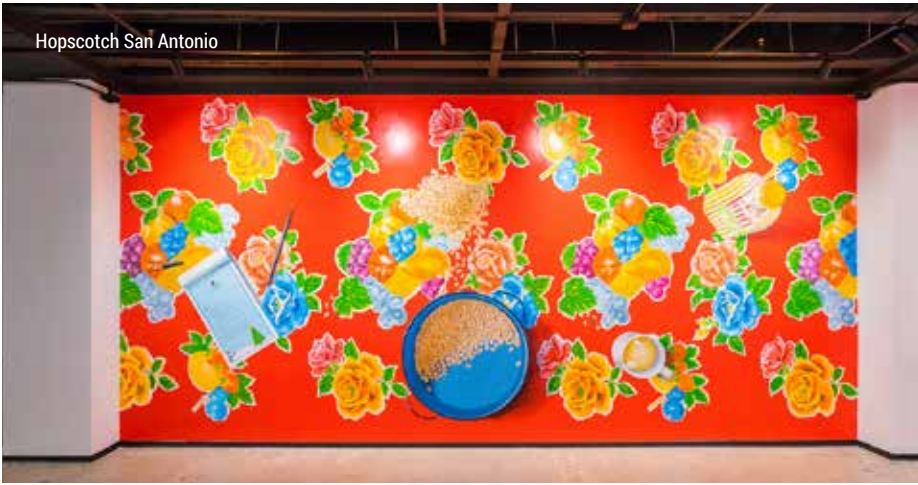
Hopscotch San Antonio