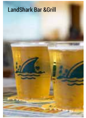
LandShark Bar & Grill