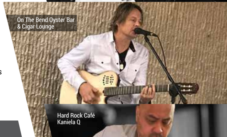
On The Bend Oyster Bar & Cigar Lounge

Located at 511 Villita Street with access from La Villita and the River Walk, Smoke BBQ + Riverbar features picturesque views amid the largest patio on the River Walk. Stop in not only for the food, craft cocktails, draft beer and charming atmosphere, but to hear live performances such as the recent ones from acts The Latin Breed, Elida Reyna y Avante, Jaime DeAnda and Kin Faux.