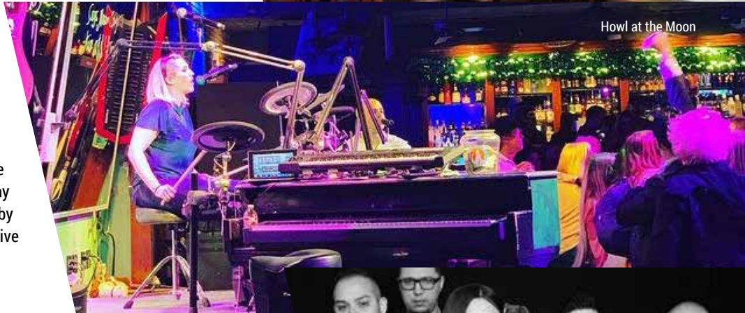
Howl at the Moon

Try your tequila with a shot of live jazz at the Naranja Tequila and Mezcal Bar nestled inside the Hotel Valencia. This one-of-a-kind cocktail lounge offers a selection of unique tequilas and mezcals coupled with the liquid smooth tunes of Latin guitar and music from the Naranja Latin Jazz band throughout the week. Stop in from 5:00 to 7:00pm Tuesday through Saturday for Latin guitar in the lobby and 7:30 to 10:00pm Thursday to Saturday for live music in the bar.