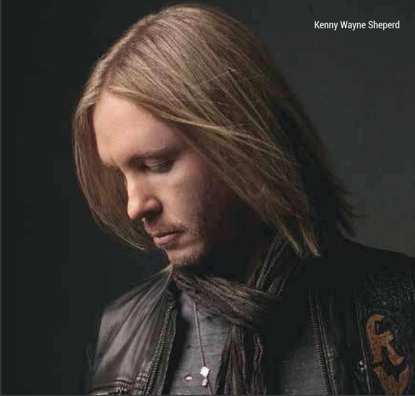
Kenny Wayne Shepherd