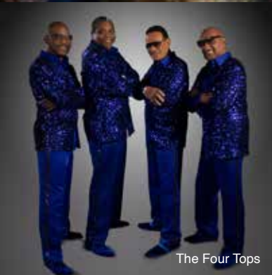
The Four Tops