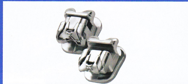
Damon Braces: Efficient and comfortable.