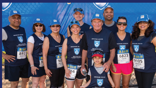
The Outreach Program with Indian Health Service was the largest team with 35 runners