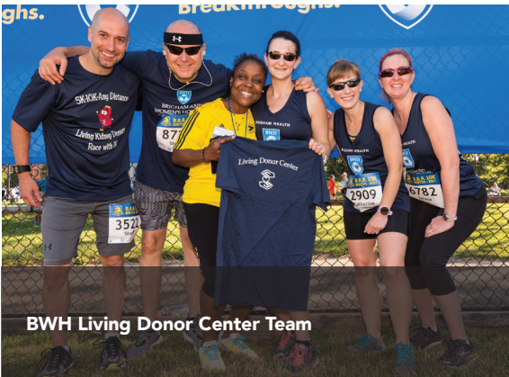
BWH Living Donor Center Team