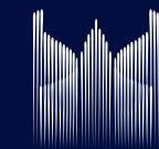
THE DUBAI FOUNTAIN

The spectacular neighbourhood of Arts and Culture