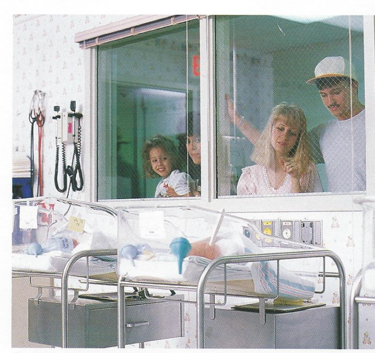
Our fully equipped nursery offers the very latest in medical equipment combined with a staff of highly skilled, family-conscious professionals.

Ours is health care the way you want it — comprehensive, high-quality, family-conscious, delivered by skilled professionals, responsive to your emotional and physical needs. At the Women's Center of Excellence, it's our gift to you. Because nothing's more treasured than the gift of giving life, and the joy and celebration of your baby's birth.