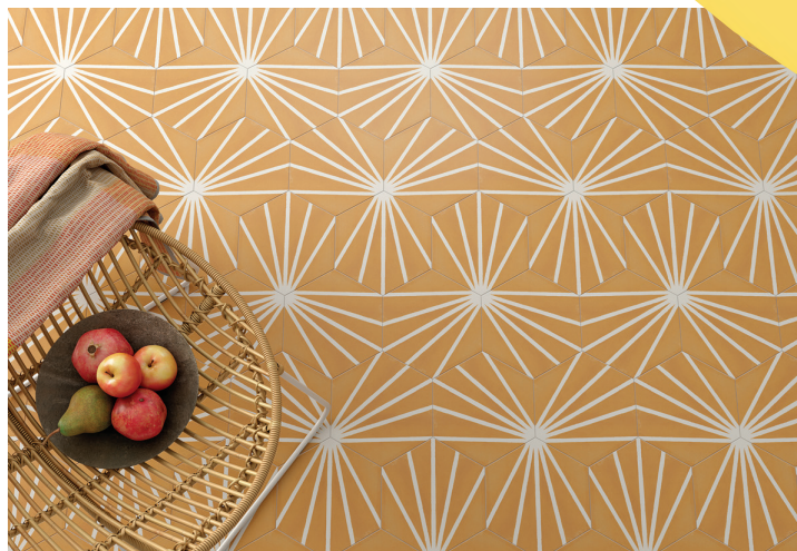
"Dancing Light" Curator Paints