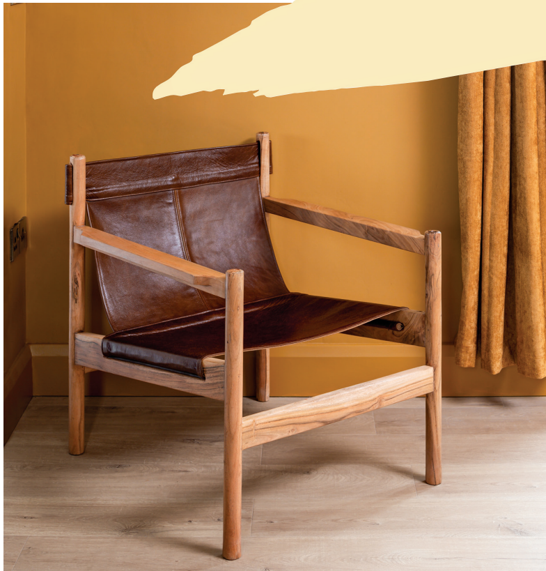
"Lemon Drizzle Cake" Curator Paints