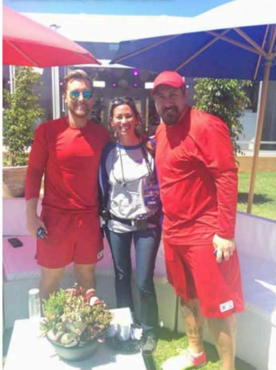
Working on set of Battle of the Network Stars with Lance Bass and Joey Fatone.

"We still go to LA quite a bit for work and to see family," she adds. "But we love coming back to Phoenix. This is our quiet, happy place."