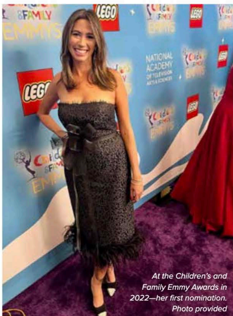
At the Children’s and Family Emmy Awards in 2022—her first nomination.