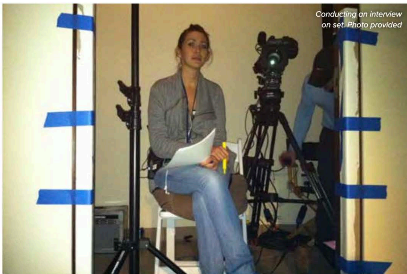
Conducting an interview on set. Photo provided