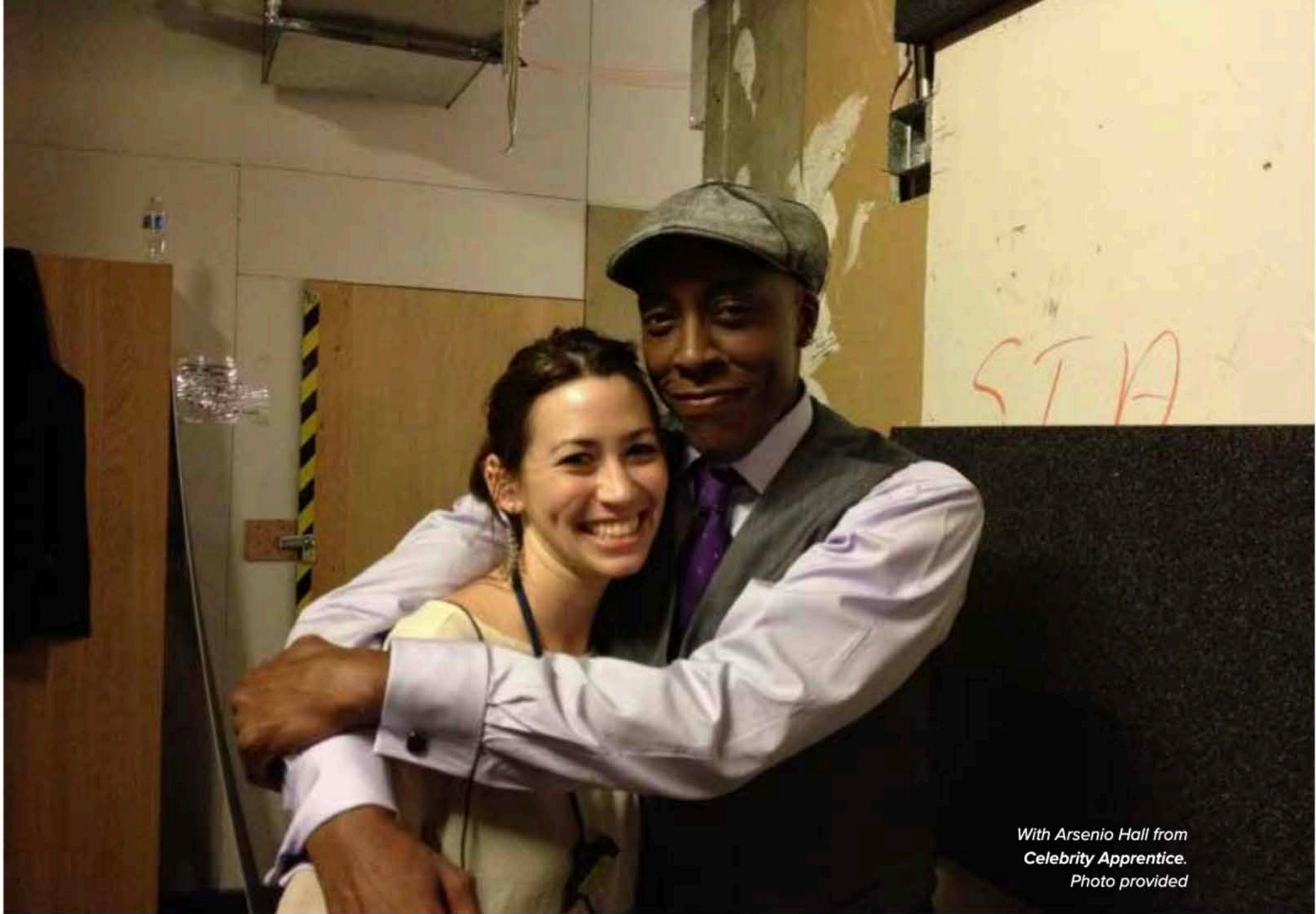
With Arsenio Hall from Celebrity Apprentice.