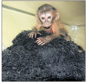
(Left) Capuchin monkey, (Right) Lion-tailed macaque and (Below) Swamp deer fawn, to be displayed at Mysuru Zoo soon.