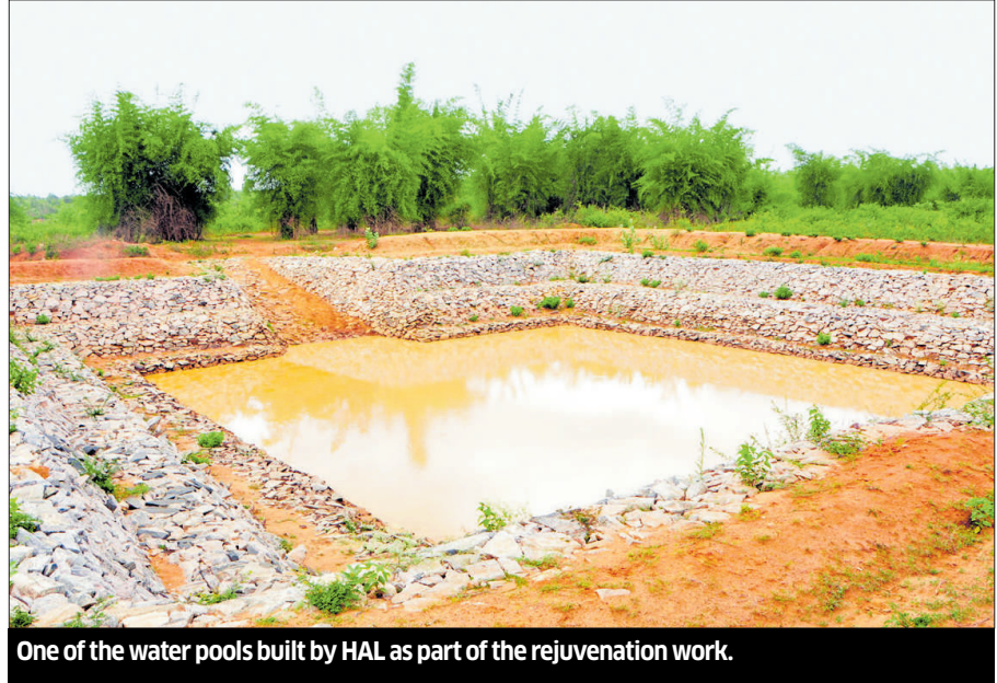
One of the water pools built by HAL as part of the rejuvenation work.

Kumudvathi is a tributary of River Arkavathi and originates from Shivagange Hills in Nelmangala taluk of Bengaluru Rural district. Both Arkavathi and Kumudvathi flow into Tippagondanhalli reservoir which