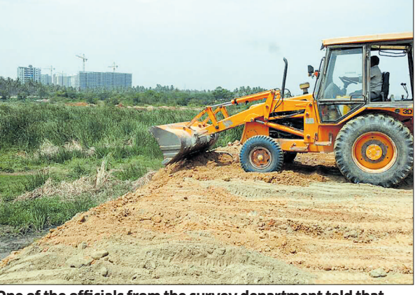
One of the officials from the survey department told that they had earlier carried out a survey of Varthur lake where around 24 acres were found to be encroached.

'After this, we will get to know the extent of encroachment and take action against violators accordingly. The mud heaps and JCBs were found in survey numbers 43 and 53 in