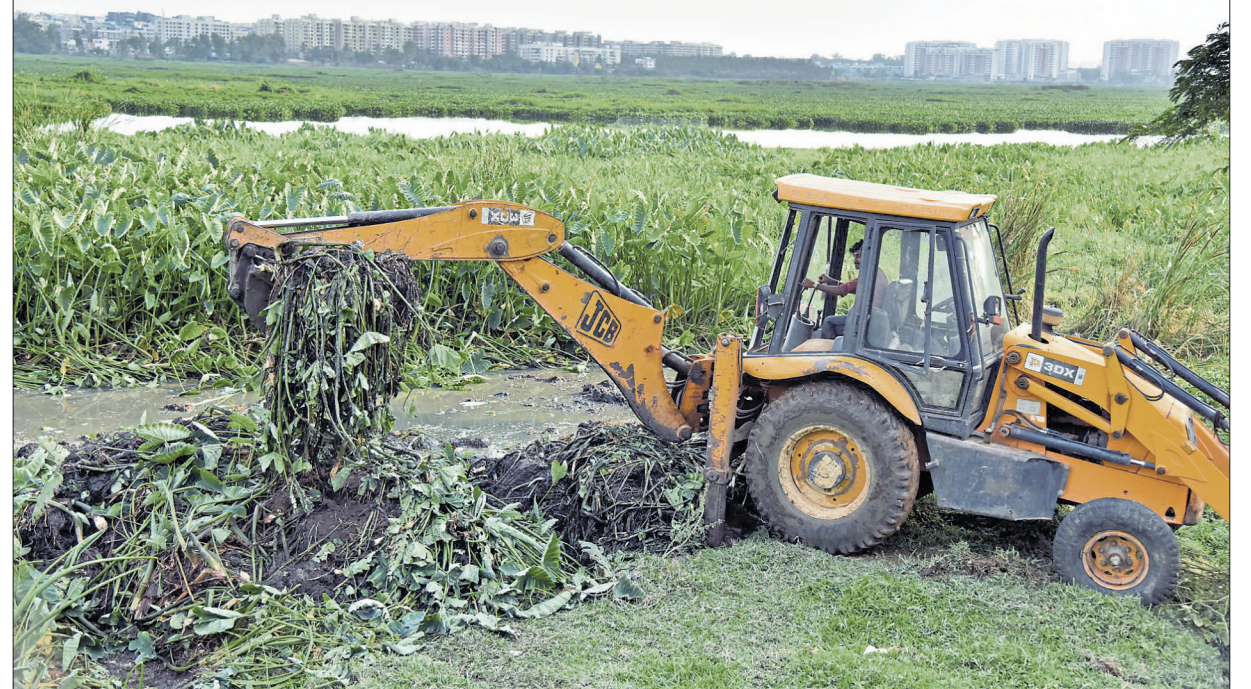
An earthmover removes silt from Bellandur lake at Iblur on Monday.

The government has created 14 organic farmers' federations to encourage farmers to market their produce. These federations will hold direct talks with the representatives of various retail companies to promote their business. Currently, organic farming is carried out in about 1.85 lakh hectares in