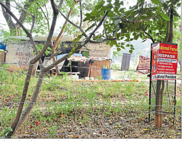
Residents' Association (DEC-A board at the ground states that DSS National Forum is the ORA) and DCCHSL wrote to owner of a part of Defence Colony Park 3, Indirangar.