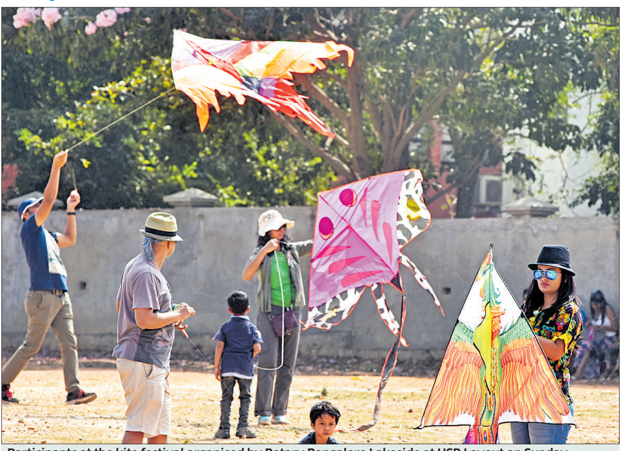
Participants at the kite festival organised by Rotary Bangalore Lakeside at HSR Layout on Sunday.