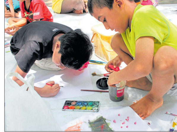
A hybrid between homeschooling and conventional pre-schools, Playjam is an experimental method for early-learners.

Sometimes the class may be in Cubbon Park or even in the aquarium!