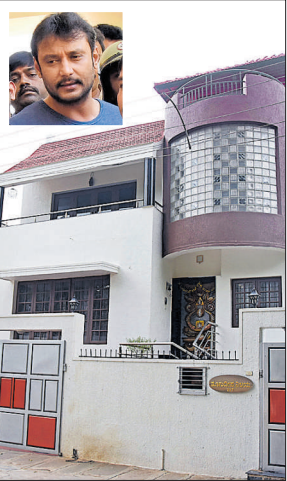
Actor Darshan's (inset) house at Rajarajeshwarinagar.