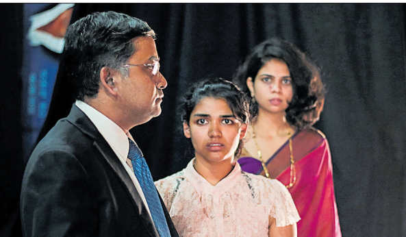
A scene from the play The Square Root of a Sonnet .

Chandrasekhar, the nephew of Nobel laureate C V Raman, was 19 and on a ship from Bombay to Cambridge when he formulated the equations that led to the discovery of black holes. But his own mentor, Sir Arthur Edding-