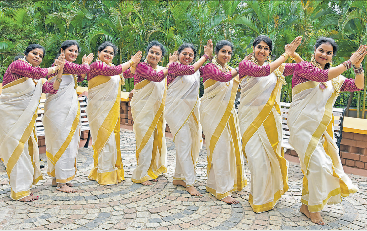
Women perform Kaikottikali, a traditional dance form as part of Thiruvonam celebrations, at Kasturinagar in the city on Wednesday.