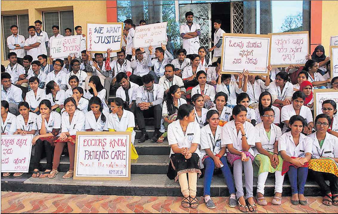
Junior doctors continue their protest for the fourth day at Hassan Institute of Medical Sciences (HIMS) on Wednesday condemning the recent attack on doctors by the relatives of an accident victim.