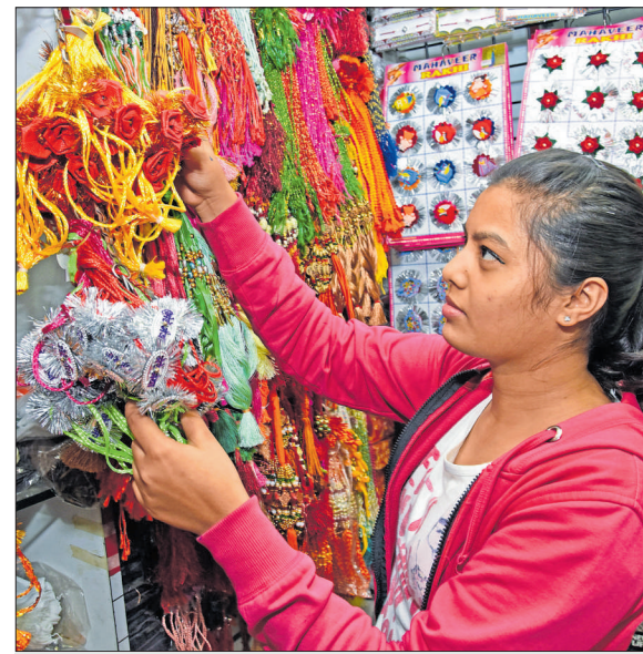
A girl looks at Rakhis displayed at a shop on Avenue Road Cross on the eve of Raksha Bandhan on Wednesday.

BENGALURU, DHNS: Chief Minister Siddaramaiah will flag off the new buses purchased by the KSRTC (Karnataka Road Transport Corporation), intending to operate them as city service in districts, on Thursday. The new 637 buses will be equipped with rearview cameras, panic button for drivers to use in case of emergency, CCTV cameras, ramp facility for the physically challenged, among others.