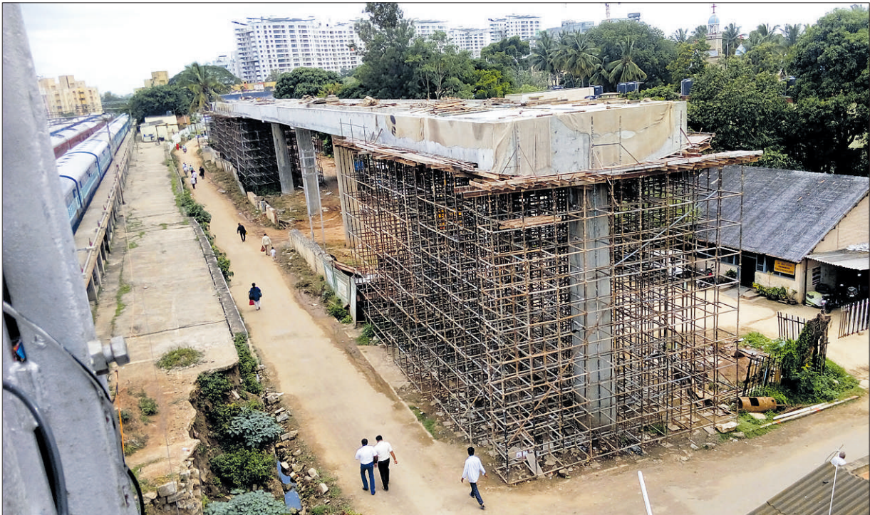
This bridge under construction will connect the Metro station with the Krantivira Sangolli Rayanna railway station.