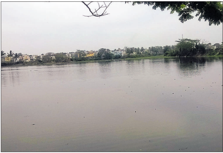
Citizens' initiative restored Alahalli lake near Anjanapura off Kanakapura Road as a pristine water body. (Right) A purple heron at the lake. The lake has become home to several migratory birds after its revival.

So how does this crowd-sourcing work? Using mobile apps such as Mapillary's OpenStreetmap or Mapunity, photographs are taken from the sites and uploaded to a map, accessible to all. The photos taken with GPS tracking are overlaid onto Mapillary, showing the black spots in the lake as animated pictures. The app's timeline feature allows multiple images of the same site. But extensive local mapping will be required to get the complete picture. According to Aras, this process begins on Saturday. The data so collated and overlaid on maps will be part of reports to be submitted to the National Green Tribunal. Rationale: Evidence-backed reports have better chance of enforcing remedial action. To improve the reliability of the maps, data gathering will be on the lines of Mapillary's Humanitarian OpenStreet Map Team (HOT). This is an initiative designed to provide accurate maps for use in humanitarian work. Often when a natural disaster strikes, changes to the human and natural landscape reduce the accuracy of maps. The HOT team then works both physically and remotely to boost reliability. Mapillary allows people on the ground with a smartphone to capture images in the area which can then be used by people with GIS experience to update the OpenStreetMap. This tool was extensively used for relief measures during the 2015 earthquake in Nepal. DH News Service