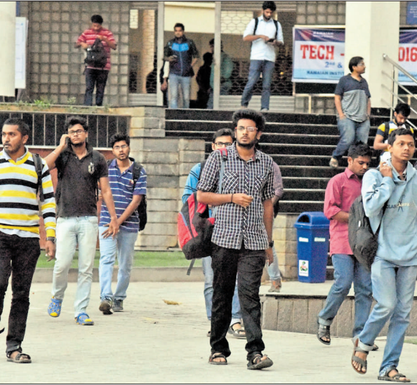
Students who appeared for CAT at M S Ramaiah College in the city on Sunday.

The Triumphant Institute of Education Management (TIME), a coaching centre, analysed the test thus, "The slot-I test takers were a relieved lot as the exam was on the expected lines with no major surprises. The IIMs have stuck to