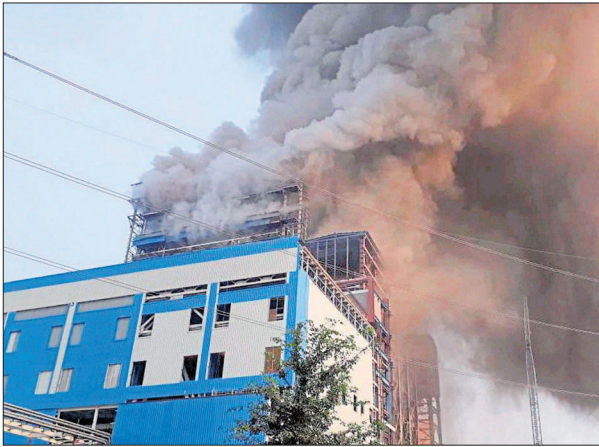
Smoke billows out after a boiler blast at NTPC’s Unchahar Power Plant in Raebareli district of Uttar Pradesh on Wednesday.

LUCKNOW, DHNS: As many as 20 labourers were killed and over 100 injured in a blast in a boiler pipe at a National Thermal Power Corporation (NTPC) plant in Uttar Pradesh’s Raebareli district, about 125 km from here, on Wednesday. According to sources, the number of casualties may increase as many labourers suffered serious burns and are stated to be critical. District officials confirmed 20 deaths, though unofficial sources put the death toll at 22. Sources said that the blast occurred around 3.30 pm in the ash pipe of the 500 MW undertrial sixth unit at the NTPC plant situated in Unchahar of the district. Around 200 labourers were working at the unit when the incident occurred. NTPC said in a statement that hot flue gases and steam that gushed out of an opening