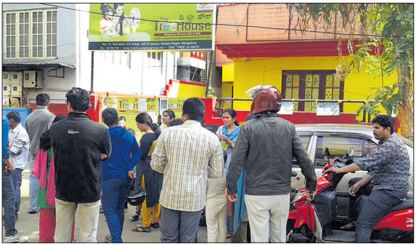
Anxious parents gather outside the Sanjaynagar branch of TreeHouse playschool on Monday.

The message to the old handset owners is clear: Dis-