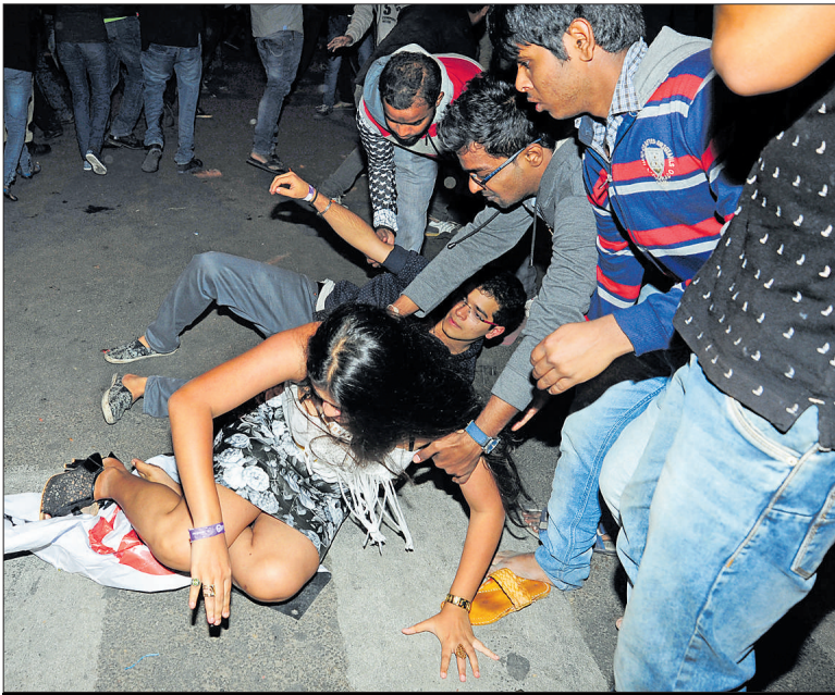
A group of youth helps a woman reveller who tripped on Brigade Road on New Year's Eve. (Right) Police cane revellers on Brigade Road on New Year's Eve.

When the school did not open on Monday, parents of the Sanjaynagar branch gathered outside the school premises to demand an explanation. The nursery, LKG and UKG classes here have a total strength of 53 students. "When I went to pay the fee in December, they did not accept my cheque. On December 19, they closed the school say-