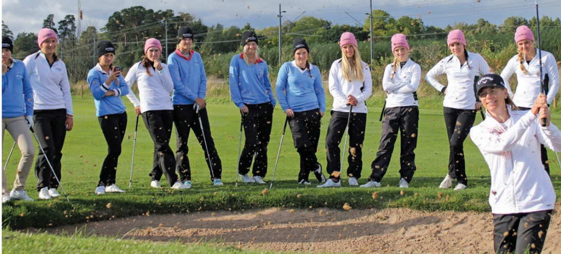
Annika Sorenstam's goal is to teach younger players her passion and holistic "Winning Approach" to each girl golfer – the same philosophy she used throughout her illustrious career.

Of all the great accomplishments that you have achieved in golf - 10 majors, 89 worldwide wins, 72 PGA Tour wins, etc.- is there anything that you hope or believe will be your greatest legacy to the game of golf?