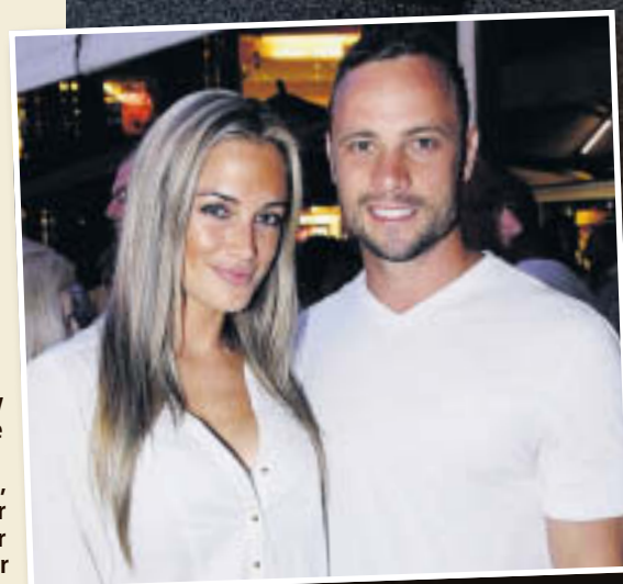
DATING: Pistorius with nationally-acclaimed beauty Reeva and, right, the runner with Justin