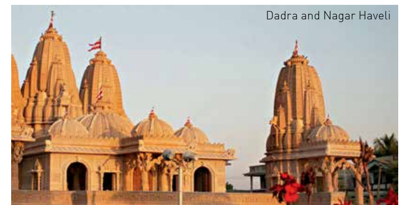
Dadra and Nagar Haveli