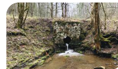
Lowhead Dam at Citico Creek © Lucas Curry/TNC; Undersized Culvert at Citico Creek © Lucas Curry/TNC; Smoky madtom © iNaturalist/Robert Lamb

At the heart of these efforts is removing barriers to the natural flow of water