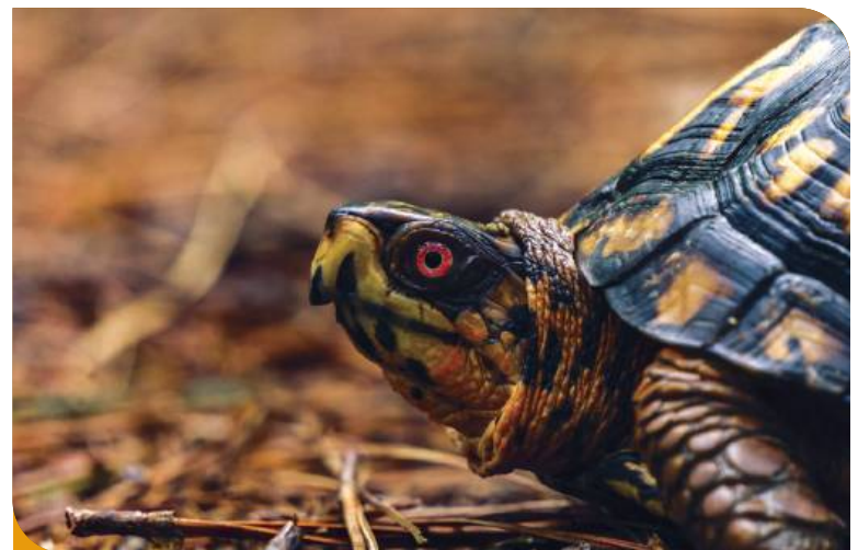
Box Turtle

We can't conserve nature without your support.