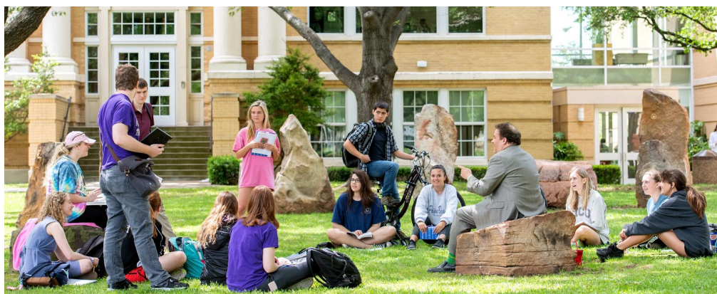
The AddRan College of Liberal Arts is home to 38 different areas of study.