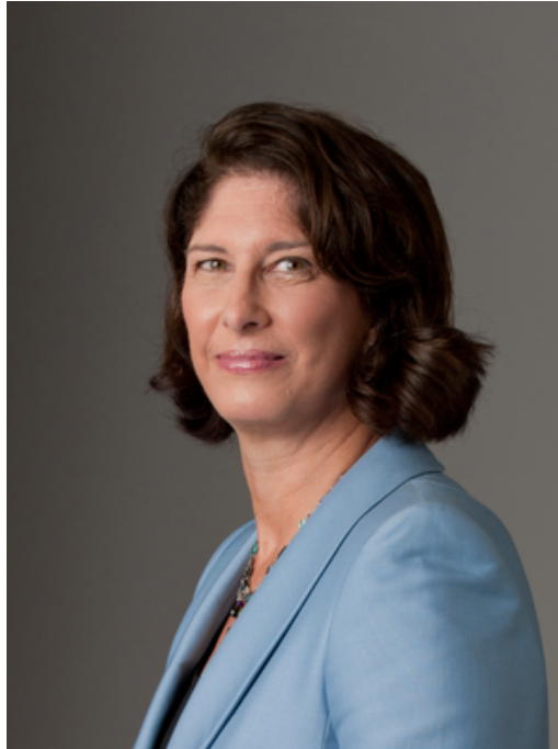
Mara Liasson was the keynote speaker of the evening, enlightening guests about the value of a liberal arts degree and her own career.

great liberal arts education. “As a History major at Brown University, I learned how to write, how to be a critical thinker, how to conduct research and how to express myself.” She went on to talk about how while the concept of liberal arts can have different meanings to different individuals, the fundamentals are all the same.