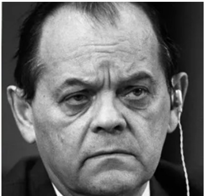
Stellan Skarsgård as Boris Shcherbina

Even in the face of calamity, the Soviet state was stubborn, unwilling to acknowledge the empire's fault. It initially denied that such an explosion had occurred. A standard-bearer for censorship and secrecy, USSR managed to cover-up the catastrophe for three days. It took more than 35 hours before an order was issued to re-locate people out of Pripyat. Soviet media subjugated by state authoritarianism disseminated sparse, misleading information.