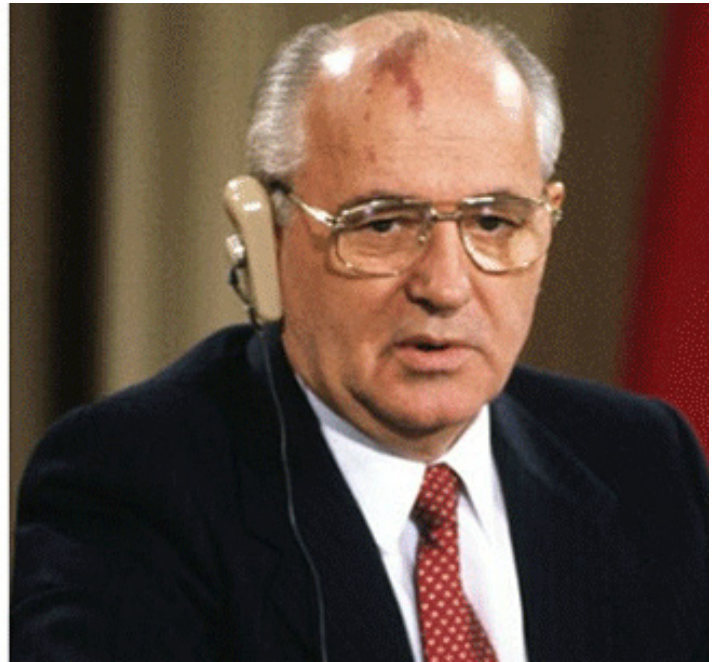
David Dencik as Mikhail Gorbachev

Chernobyl, the series, is brutal and haunting. But the real story is even more depressing. While it displays the 'naked' heroism of miners burrowing under the power plant to stop melted uranium from reaching ground level, it cuts short of explaining that the tunnel they risked their lives to build was never necessary. The miners were exposed to radiation levels between 80,000 and 160,000 chest X-rays, according to the World Health Organisation.