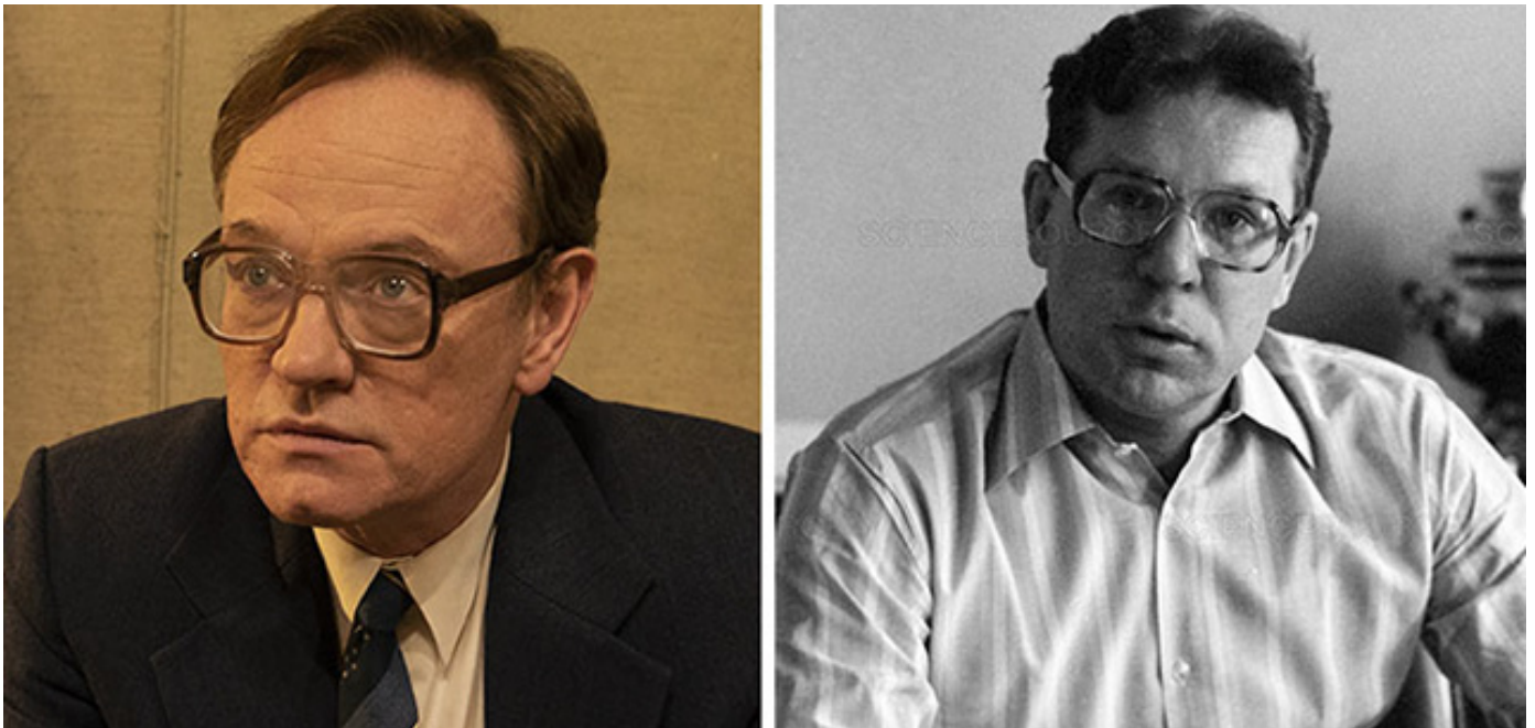
Jared Harris as Valery Legasov

Revisiting Russia in these sombre episodes of torment is TV/Film veteran Jared Harris who plays, Valery Legasov, the leading nuclear physicist commissioned by General Secretary Mikhail Gorbachev to lead the investigation alongside Vice-Chairman of the Council of Ministers Boris Shcherbina (the incredibly talented Stellan Skarsgård). Together, they arrive at Chernobyl to take stock of a nuclear time-bomb situation keeping in mind the threat of a perpetual radiation epidemic. Ilana Khomyuk (Emily Watson), a composite character created to emulate the efforts of the unknown men and women in the multi-faceted tragedy, traverses through the man-world, knocking at uninvited doors to understand how and where things went south at the Chernobyl nuclear facility.