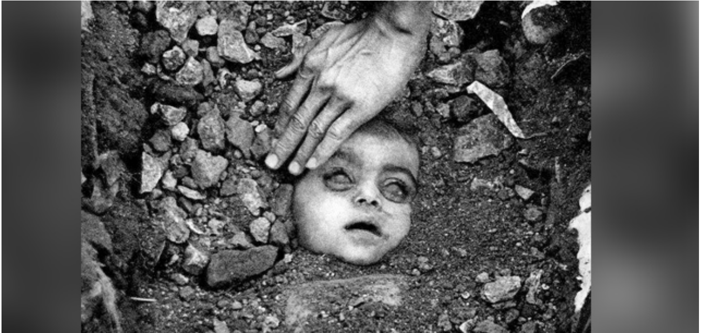
'Bhopal gas disaster girl': The famous photo taken by Raghu Rai

In the intervening night of 02 - 03.12.1984, around 40 tons of methyl isocyanate gas (MIC) accidentally leaked into the air from a pesticide plant managed by Union Carbide Corporation (now owned by Dow Chemicals), engulfing surrounding slum areas and suffocating tens and thousands. "Children, women, old men dying and dead on the roads. Carcasses of dogs, cats, chickens, goats, buffaloes, cows, birds lay everywhere," read a New York Times article published a week after the incident.