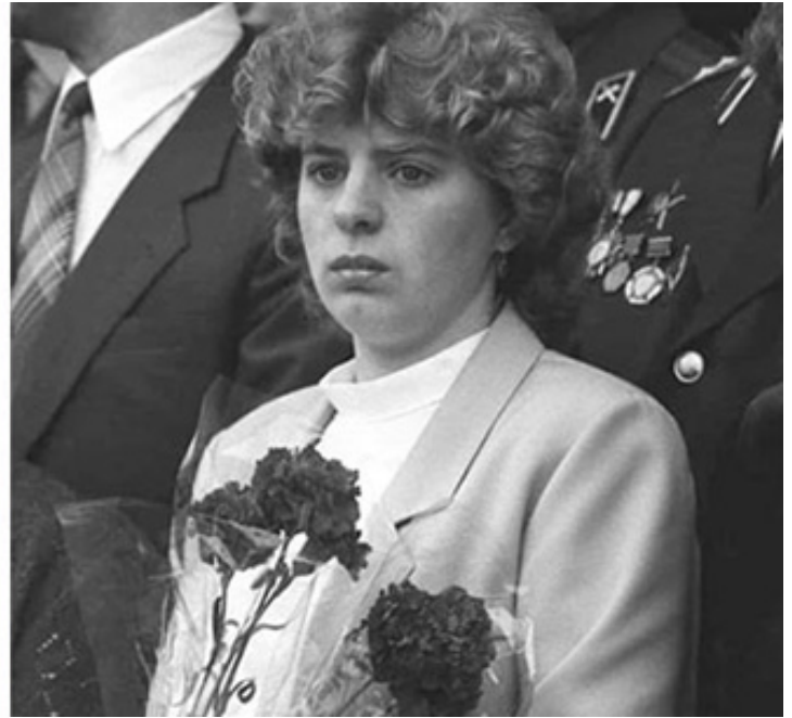
Jessie Buckley as Lyudmilla Ignatenko

The five-part autopsy dissects history but still creeps up with inconsistencies. At the end of the series, HBO claims, "It has been reported that none survived the 'Bridge of Death'". There is no thorough evidence to support the claim that a group of people watching the Chernobyl fire from the overpass were exposed to radiation that killed them in a few years. The true fate of what happened on the bridge remains largely unknown.