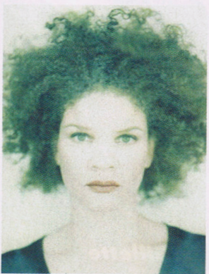
MICHAELA ANGELA DAVIS Fashion and Culture Expert

Haki R. Madhubuti, who contributed to this month's "Two Sides," has published more than 28 books and is a best-selling author of poetry and nonfiction. His latest release is YellowBlack: The First Twenty One Years of a Poet's Life (2006) , a memoir. In 1967, Madhubuti founded Third World Press in Chicago, one of the nation's oldest independent publishers of Black literature. Currently, he is the University Distinguished Professor and professor of English at Chicago State University.