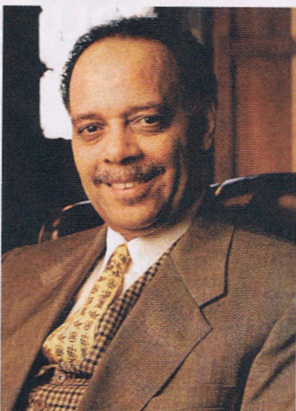
HAKI R. MADHUBUTI Publisher and Author