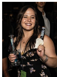
BELLE AT THIS YEAR'S EMERALD CUP AWARDS.