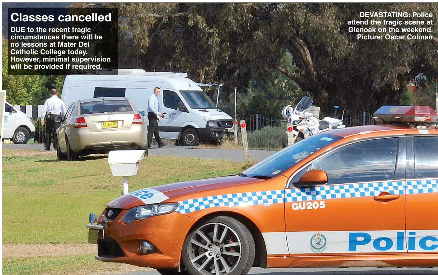
DEVASTATING: Police attend the tragic scene at Glenoak on the weekend.

DUE to the recent tragic circumstances there will be no lessons at Mater Dei Catholic College today. However, minimal supervision will be provided if required.